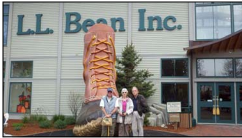
Happy 100th Birthday, LL Bean!