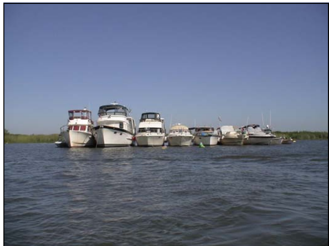
RVYC anchored at Three River Reach for July 4th